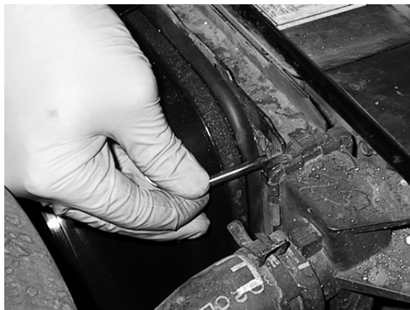
Install temp. probe near inlet hose...