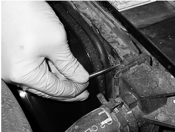
Install temp. probe near inlet hose...