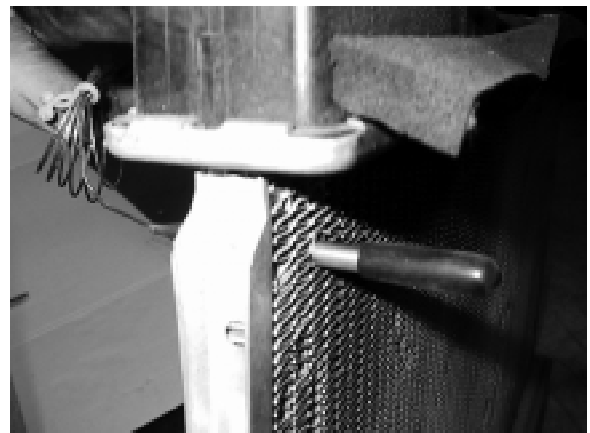
then replace the insulator cap.

Locate the inlet hose from the engine to the radiator. Remove the black insulator cap and insert the temp. probe through the radiator fins near the inlet hose. Reinstall the black insulator cap.