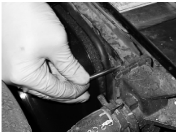
Install temp. probe near inlet hose...